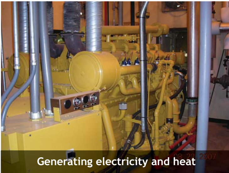
Generating electricity and heat

1950s: City staff connected a methane gas power generator to the bio-solids collected at the Waste Water Treatment Plant. The excess heat generated is used to heat the facility and the waste lagoons. The electricity produced is sold to Idaho Power.